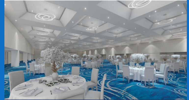
Symphony Ballroom – 16,684 sq. ft.